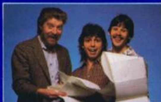
Adapted by Beck-Tech.